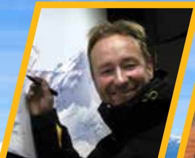
Kjetil Andre Aamodt